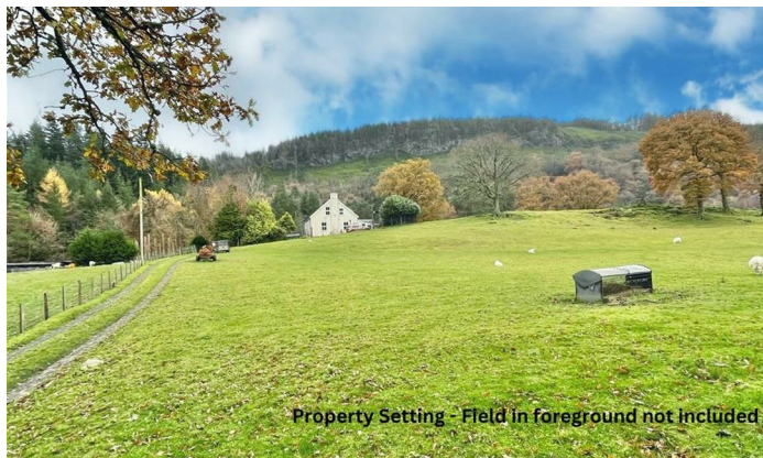
Property Setting - Field in foreground not included

The property further benefits from ground source heating, UPVC double glazing and generous natural light throughout.