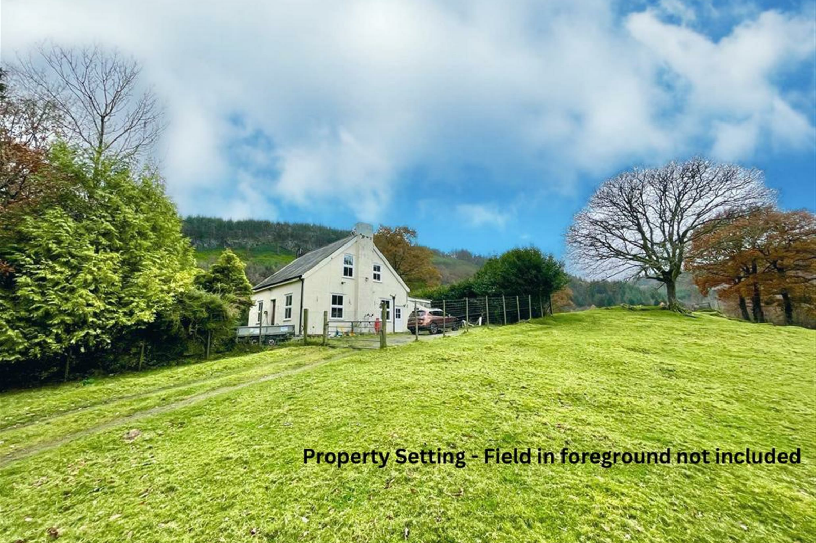
Property Setting - Field in foreground not included